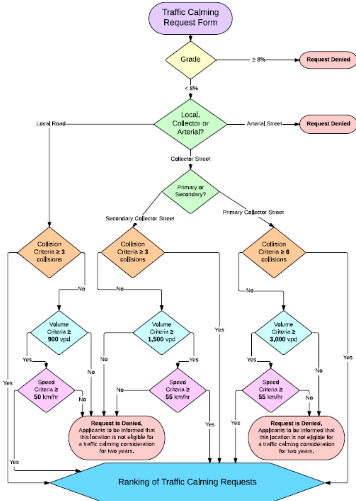
Figure 1 – Initial Screening Flow Chart for Traffic Calming Requests